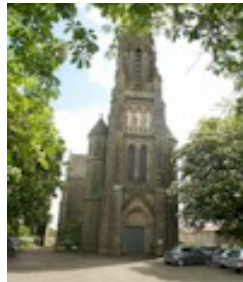
La Chapelle Palluau Saint Pierre