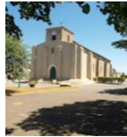
La Chapelle Achard Notre-Dame-de-L'Assomption