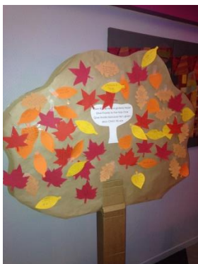
Tree of Gratefulness