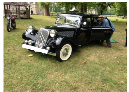
Scenes from the classic car fundraising event, September 2016