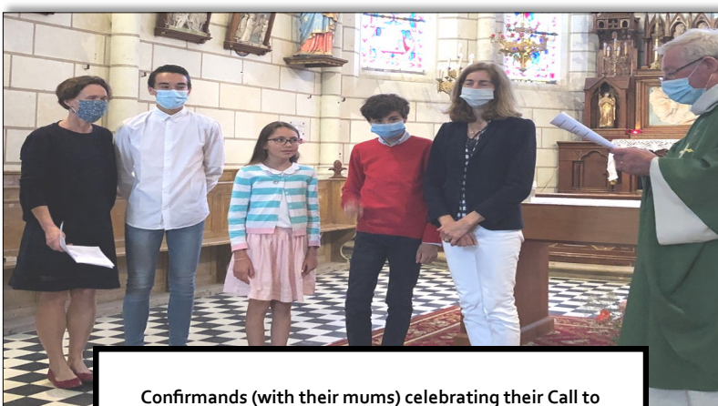
Confirmands (with their mums) celebrating their Call to Discipleship

We thank God for his goodness to us for yet another year and pray for the grace to continue faithfully in his service.