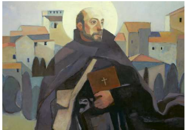
St Ignatius Loyola (1491–1556)

Dearest Lord, teach me to be generous; teach me to serve You as You deserve; to give and not to count the cost, to fight and not to heed the wounds, to toil and not to seek for rest, to labour and not to ask for reward save that of knowing I am doing Your Will.